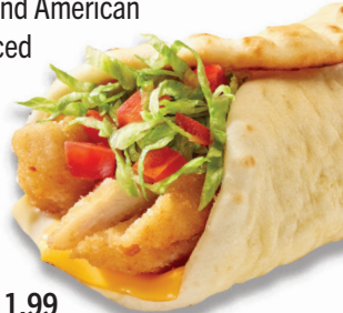
THE ORIGINAL HANI™

Premium chicken tenderloins cooked golden brown and crispy, wrapped in our own special recipe pita bread with Swiss and American cheese, shredded lettuce, diced tomatoes and mayo. 10.99 Substitute with a southwest veggie burger as a delicious vegetarian option for 1.00