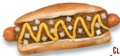
CLASSIC CONEY DOG

Melted cheddar cheese, freshly chopped bacon and sautéed onions. 5.49